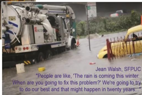
Jean Walsh, SFPUC

"We're not asking you to protect us from flooding. We're asking you to fix your sewer system so it won't overflow."