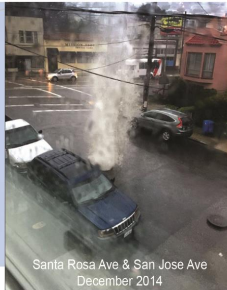
Santa Rosa Ave & San Jose Ave December 2014